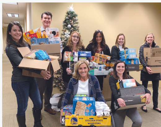
Summit team members pose with donations for Blue Star Moms, an organization that sends care packages to troops overseas.