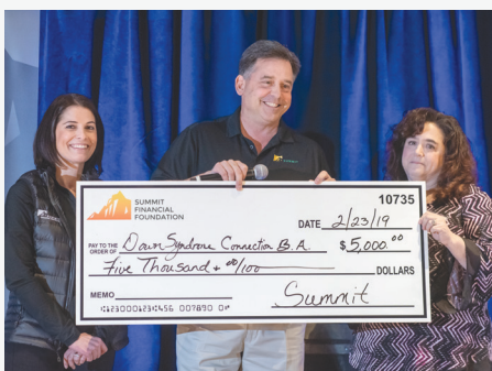
Summit donates to the Down Syndrome Connection Bay Area at our 2019 Summit Symposium.