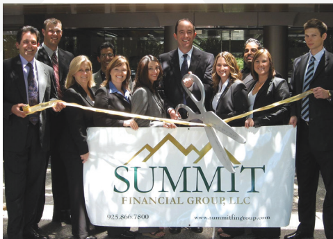
The Summit team celebrates the grand opening of our first Crow Canyon Place office in 2007.

Some of you may remember our first office in a dark corner of the old Bishop Ranch Complex. We were so crammed in there that clients would hit a cubicle as they entered the front door, and associates had to work from a conference table due to the lack of desk real estate. Eventually, we made it to our current suite on the fourth floor of the Plaza San Ramon building and that old space was (thankfully) demolished to make way for the new San Ramon